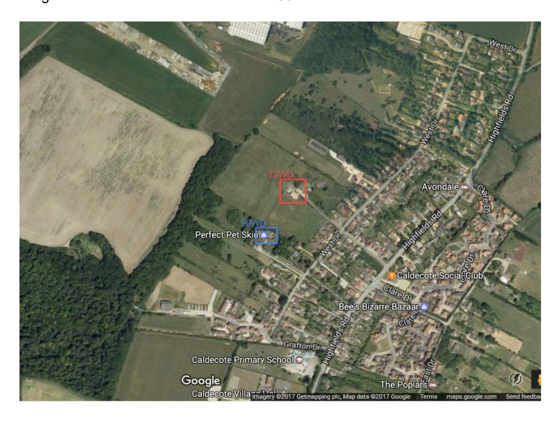
Diagram 2: Source Google maps

The diagram above purports to show 390m as the longest separation, but it ignores the properties at No. 72 West Drive and No. 90 West Drive which are outside the village development framework, making the separation more like 200m to those properties. These are shown for clarity in the Diagram 2 below. No. 72 in red and No.90 in blue.