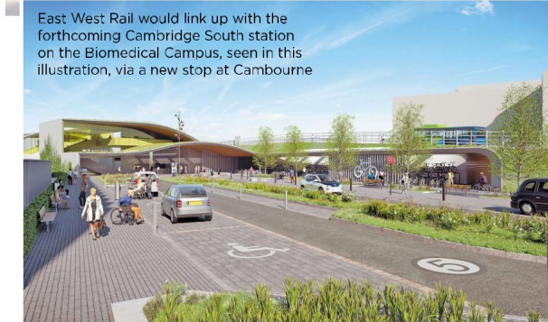
East West Rail would link up with the forthcoming Cambridge South station on the Biomedical Campus, seen in this illustration, via a new stop at Cambourne